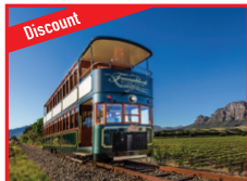
Franschhoek Wine Tram Tour