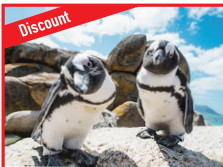
Cape Point & Penguins Tour