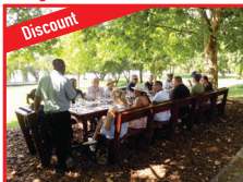
Stellenbosch, Franschhoek & Paarl Tour