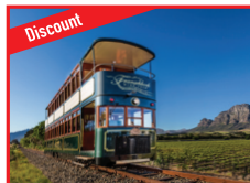
Franschhoek Wine Tram Tour