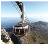
TABLE MOUNTAIN AERIAL CABLEWAY