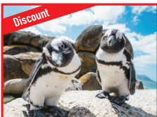
Cape Point & Penguins Tour