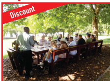
Stellenbosch, Franschhoek & Paarl Tour